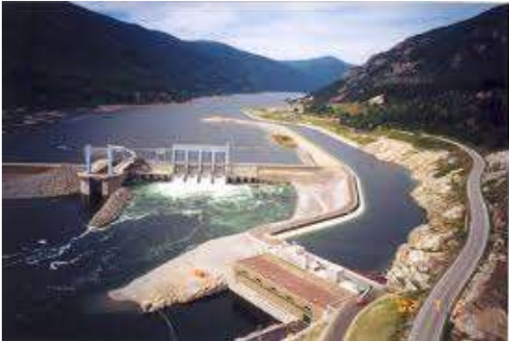
Hugh Keenleyside Dam: The earth fill and concrete structure was declared operational on October 10, 1968, nearly six months ahead of schedule. The dam is about 52 m (171 feet) high, with a crest length of 853.4 m (2,800 ft.). 366 m (1,200 ft.) of the crest length is concrete dam and the rest is earth fill dam.